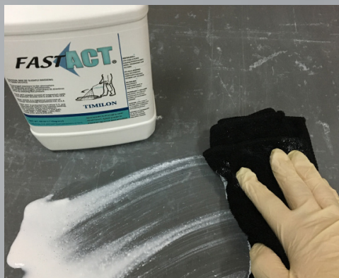
FAST-ACT Liquid Decon is easy to use. You just pour and wipe.